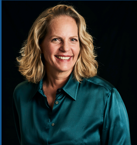
Mrs Ariane de Rothschild, Chairwoman of the Board

Founded in 1905 in the heart of Paris, the Rothschild Foundation Hospital is a university hospital, private but not for profit, which participates to the hospital public service.